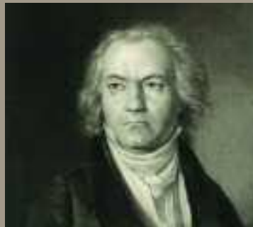
Ludwig van Beethoven